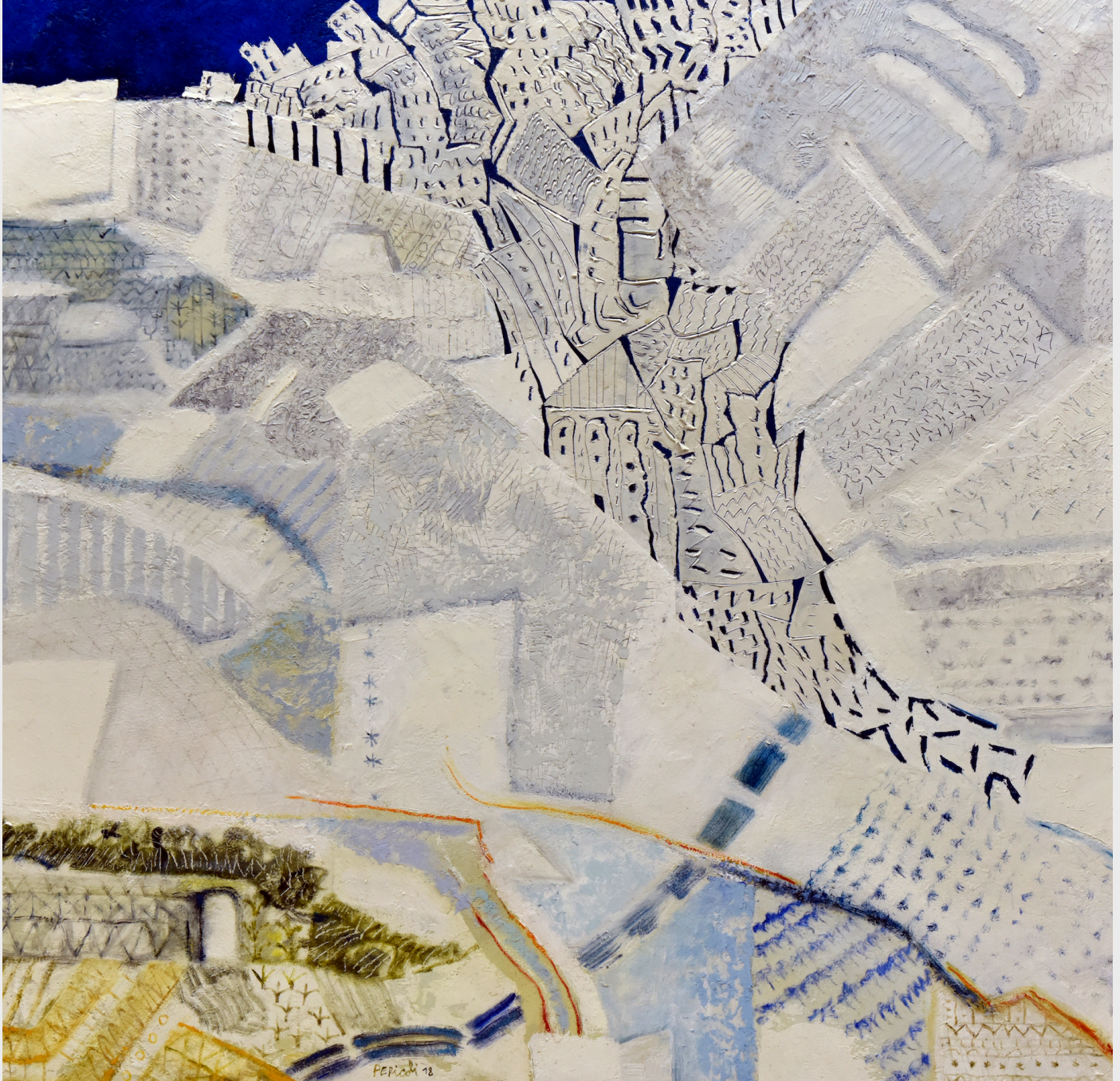
Tullio Pericoli, Centri abitati, 2018